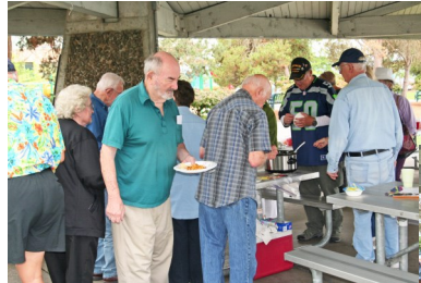
Lots of good food & Hungry

eaters, it was shirt sleeve temperature and not a drop